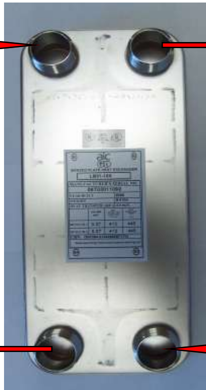
This shows counter current flow design

WARNING PLEASE MAKE NOTE: THIS UNIT IS NOT FOR USE IN POOL APPLICATIONS!!!